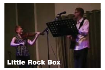
Little Rock Box